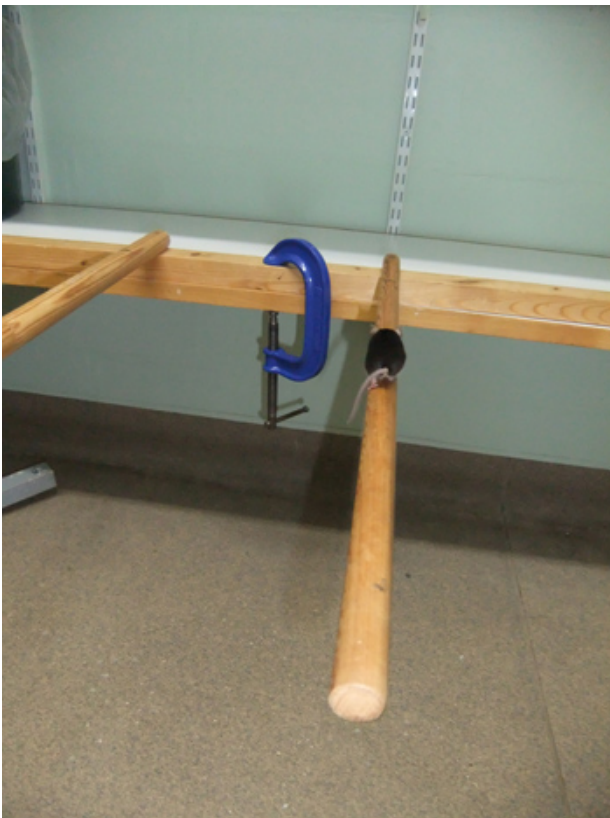
Figure 4. A mouse traversing a static rod.