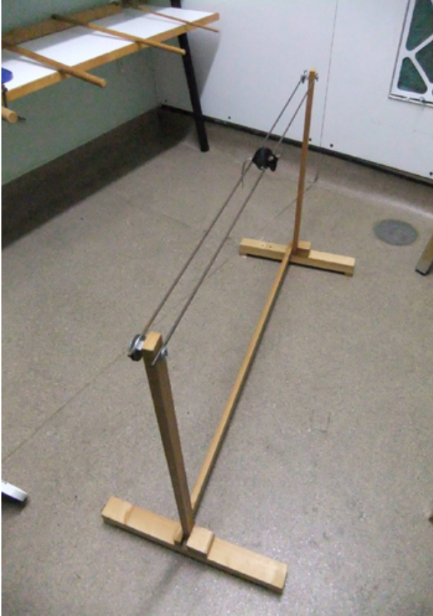
Figure 5. A mouse on the parallel bars. Padding has been omitted for demonstration purposes only.