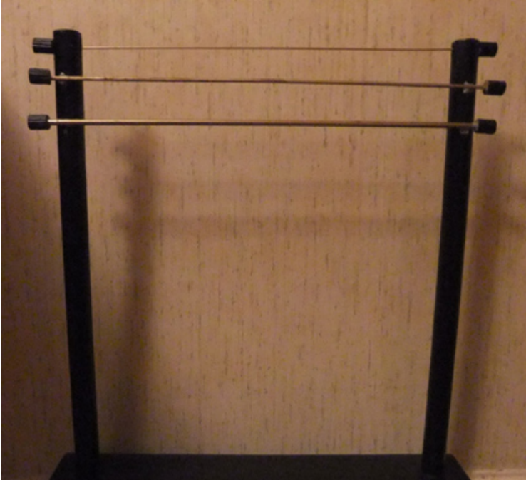
Figure 3. The triple horizontal bars. The bar held in the notches is the basic 2 mm one; tacked beneath it (for demonstration purposes only) are the 4 and 6 mm bars. In practice, only one bar at a time is slotted into the notched supports.