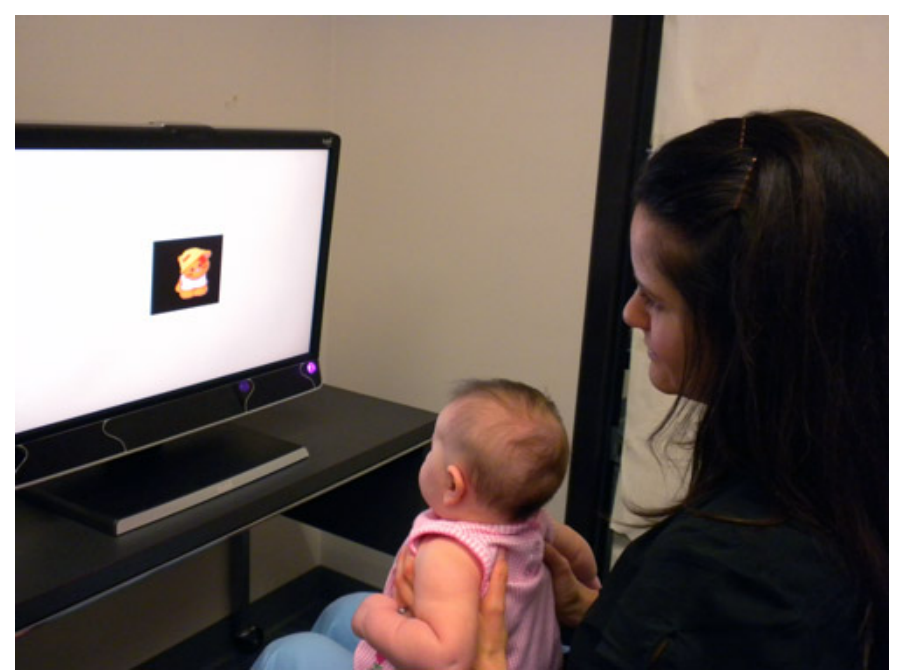
Figure 2. A child may sit on the lap of the caregiver if the child requires physical assistance in sitting, or if it is necessary for maintaining compliance.