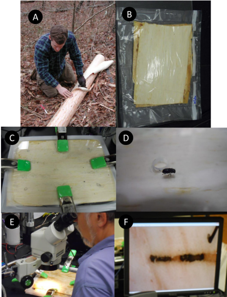
Figure 2. A) Removal of phloem after bark was scraped off of tree. B) Fresh phloem stored in vacuum sealed bag. C) Phloem sandwich with clamps holding the acrylic pieces together and Parafilm around edges to prevent contamination and desiccation of phloem. D) Bark beetle near hole drilled into acrylic. E) Using microscope to observe phloem sandwich. F) Video display of bark beetles within phloem sandwich.