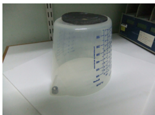
Figure 1. A plastic domestic jug converted for use as a hyponeophagia testing unit. Sweetened condensed milk can be placed in the small food well located inside the spout, which conveniently directs the attention of the mouse straight to it. The lead weight glued to the inverted base of the jug helps to stabilise it against any movement of the mouse against the walls.

As in other tests where odour could play a significant role, non-experimental mice should be placed in the apparatus before testing starts. Follow a standardised cleaning protocol between all mice. Remove urine/faeces, wipe the food well and the plastic base with moist followed by dry cloth/tissue. Refill the food well with milk (about 0.2 ml, to the rim of the well).