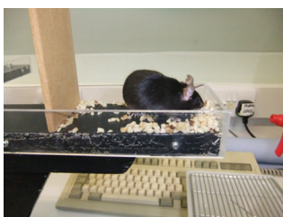
Figure 4. Another hyponeophagia test unit. The food presented is mixed chopped nuts.