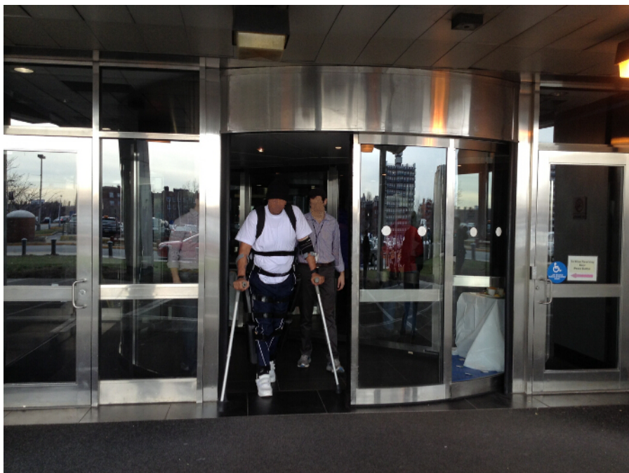
Figure 8. Walking out of a revolving door. This figure demonstrates a person walking out of a revolving door. Please click here to view a larger version of this figure.