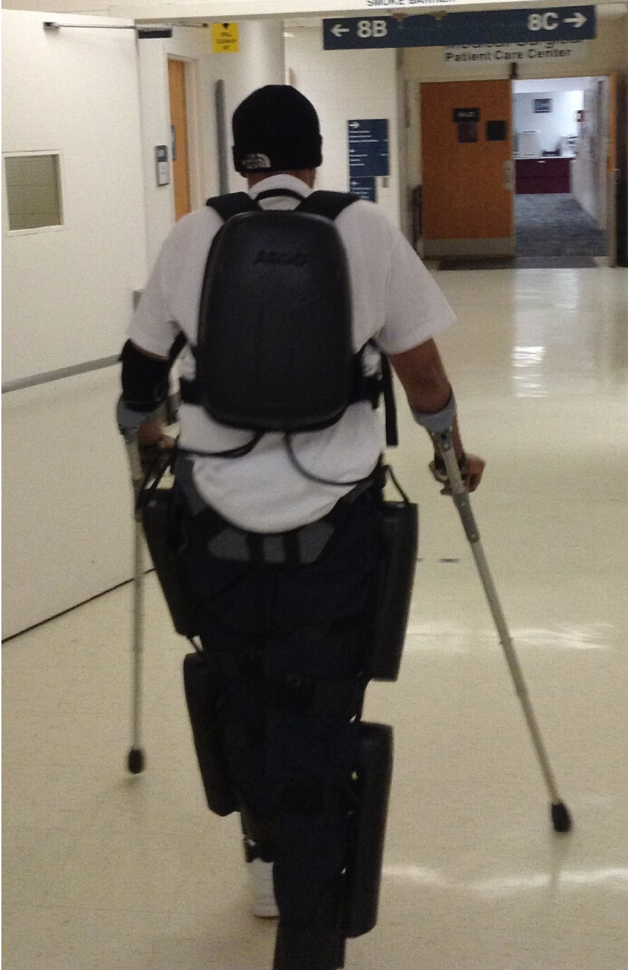
Figure 3. Walking indoors on a smooth surface. This figure demonstrates a person walking indoors on a flat surface. Please click here to view a larger version of this figure.