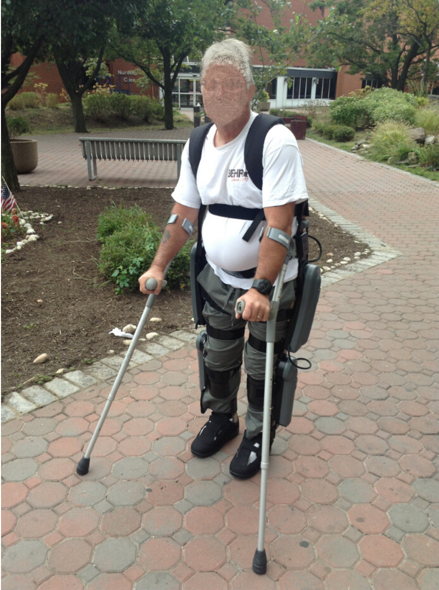
Figure 1. Two handed crutch balance. This figure demonstrates a person standing still and balancing with both crutches. Please click here to view a larger version of this figure.