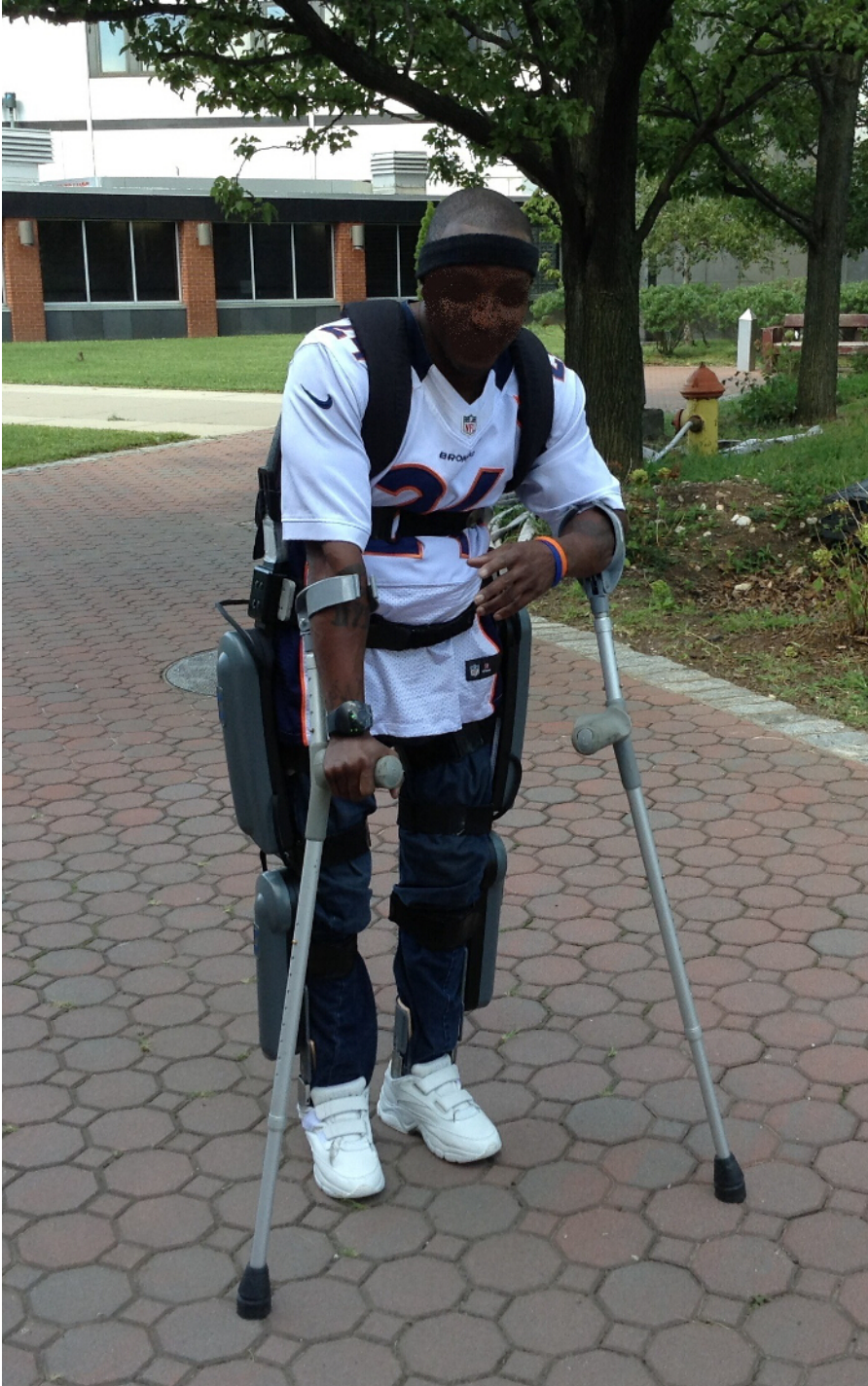
Figure 2. One handed crutch balance. This figure demonstrates a person standing still and balancing with only 1 crutch. Please click here to view a larger version of this figure.