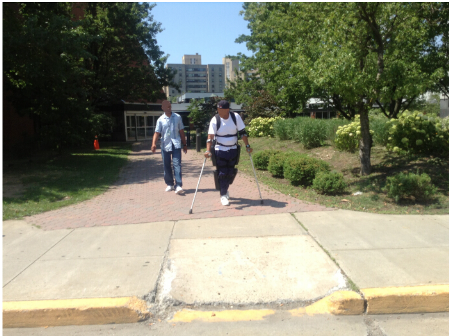
Figure 6. Walking on slopes. This figure demonstrates a person walking outdoors down a curb cutout. Please click here to view a larger version of this figure.