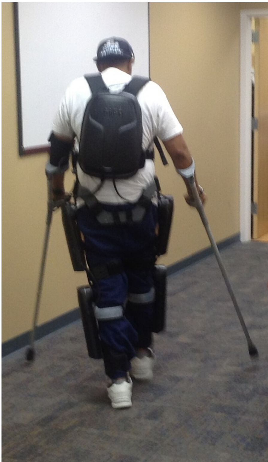
Figure 4. Walking on carpet. This figure demonstrates a person walking indoors on a carpeted surface. Please click here to view a larger version of this figure.