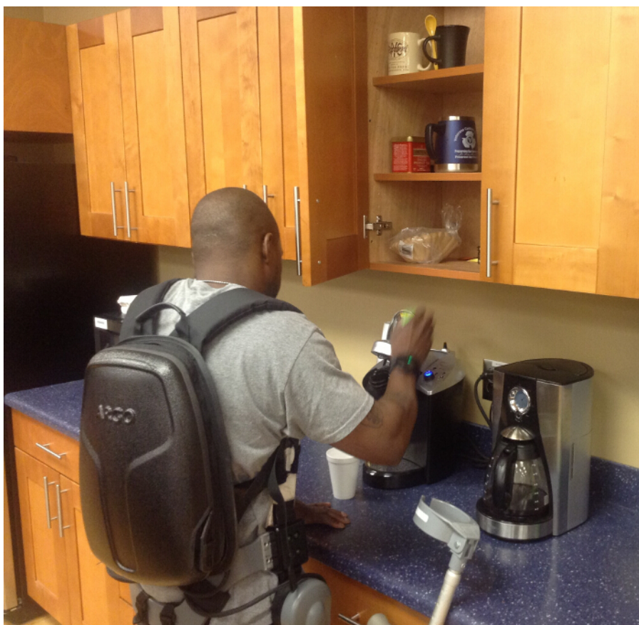
Figure 9. Overhead cabinet and countertop reaching. This figure demonstrates a person taking items out of an overhead cabinet. Please click here to view a larger version of this figure.